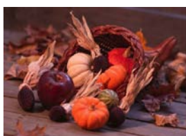
Happy Thanksgiving – from the students, staff and trustees of Waterloo Region's Catholic Schools!!

...DID YOU KNOW... Waterloo Region's Catholic Schools are among the most giving in Ontario – raising more than $4 million for various charities since 1998. ...AND THAT... Last year alone we raised $491,667 – the equivalent of more than $21 per student!!