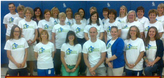
Back to Class!! The staff of Our Lady of Grace CES were in the "Back to School" spirit right away on September 3 rd – greeting their students in their new "team uniforms"!