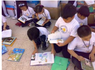
Students at the Philippine School in Doha, Qatar (above) enjoy the 424 boxes of books sent to them last summer by Waterloo Region's Catholic Schools.