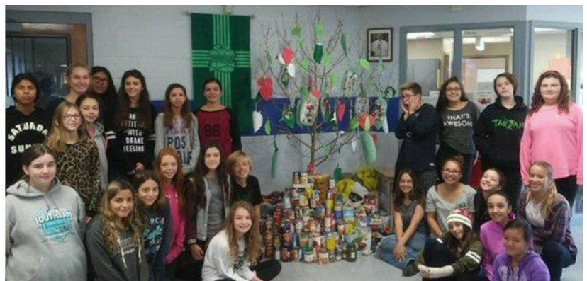
Students at St. Gabriel CES (left) and Sir Edgar Bauer CES (right) know all about being "People of Love" & "People of Hope" . St. Gabriel collected 100's of pairs of socks for the homeless during "Socktober" while SEB collected more than 500 food items in just three days!