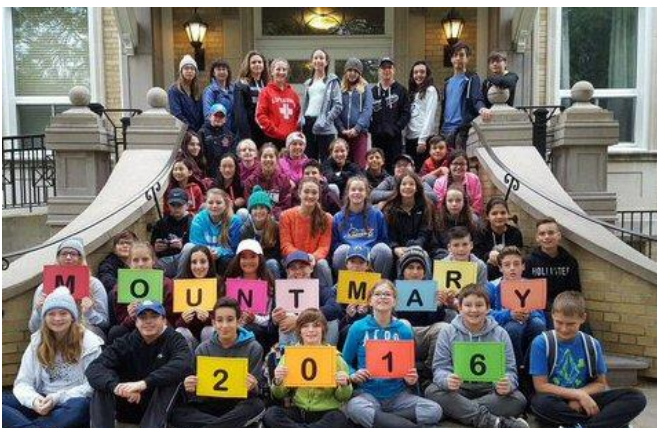
As these "Great 8's" from St. Augustine CES know, the retreat at Mount Mary is a not-to-be forgotten experience!